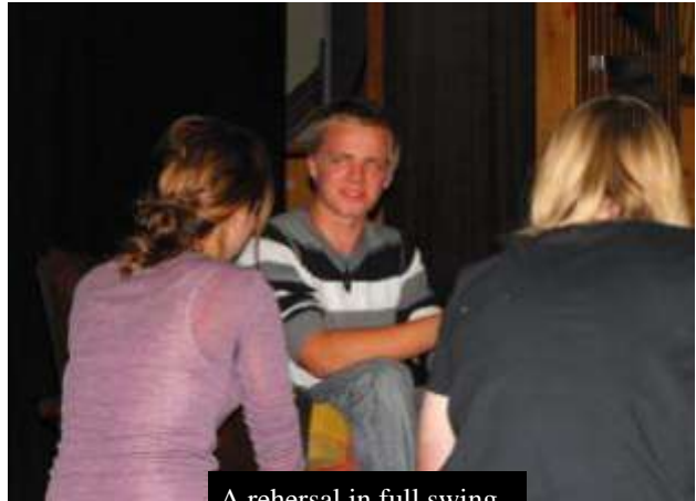
A rehearsal in full swing