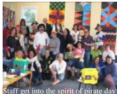
Staff get into the spirit of pirate day