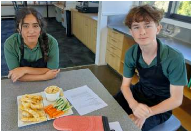
Home Economics Year 9, Year 7 & 8