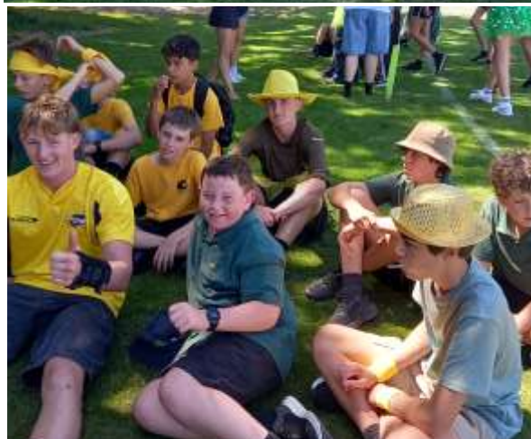
House Fun Day last Friday afternoon