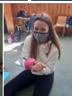
Left and below: photos from the Gateway/ Outdoor Education Red Cross First Aid course