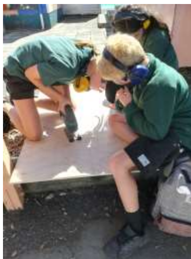
Right: Exploratory Studies; students cutting out shapes for a mural.