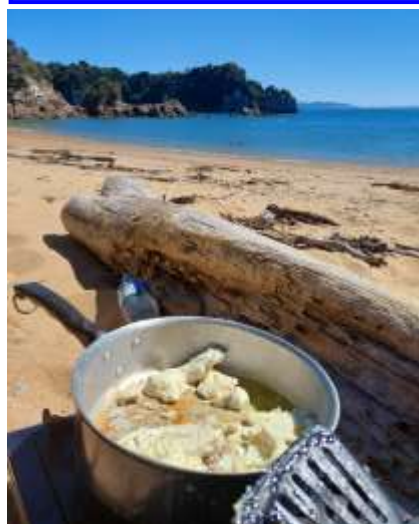
Left: Fry up on the beach fresh snapper fresh slice bread. Da boom. Eric

Please contact Dom Hammond (027-8996189 , dominic.hammond@gbh.school.nz ) if you are able to help.