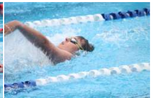
More photos from the swimming sports