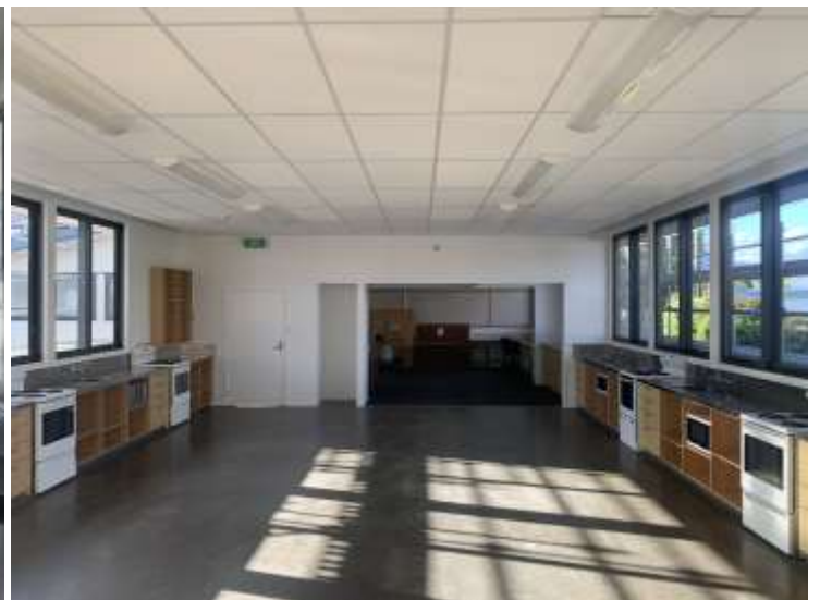
The finished Home Economics room