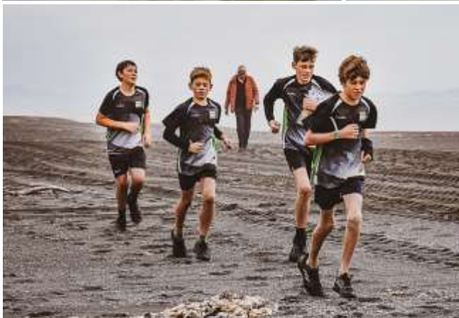
Kaikoura Adventure Race action photos