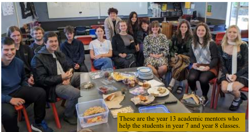
These are the year 13 academic mentors who help the students in year 7 and year 8 classes.