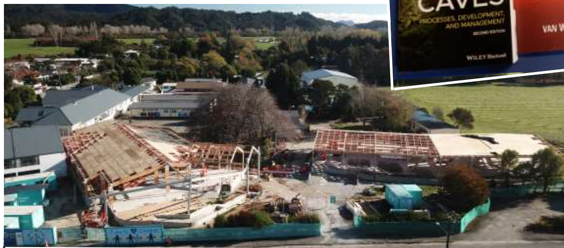
Building Progress. Drone footage end of May