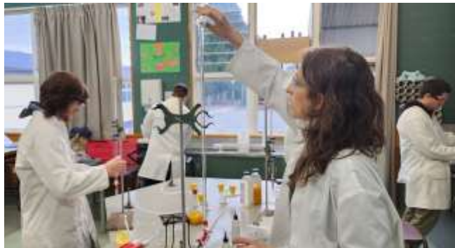
And liver enzyme investigations (below)