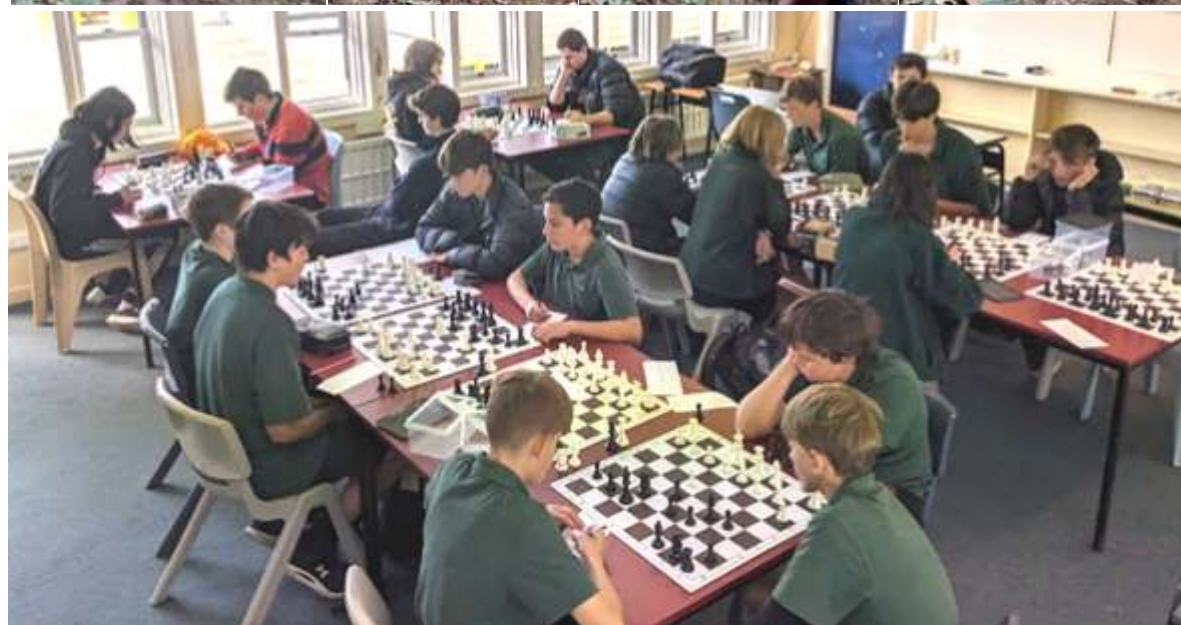
Lunchtime chess GBHS teams tournament. Five teams compete each week for the battle of chess champions .