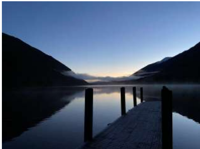
Photo left: The view from the jetty at Coldwater Hut once we had woken up and dismantled our tents and bobby shelters.

"Our Y11 cohort really impressed me with their teamwork and cooperation in building shelters, the way that they supported and encouraged each other during the tramp, and the respect that they showed for the environment by carefully inspecting the campsite and carrying out litter sweeps before departing in the morning."