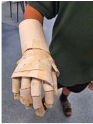
Yr 7/8 Art Lokie's robotic hand.