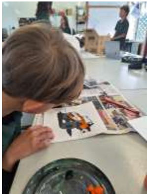
Yr 7/8 Art Year 7/8 Art working on their projects.