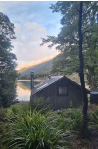
Stillwater Hut, Lake Rotoiti

Nelson Anniversary Day: Monday 29 th January Waitangi Day Public holiday: Tuesday 6 th February Easter: Good Friday 29 th March, Easter Monday and Tuesday 1 st and 2 nd April Anzac Day: Thursday 25 th April (during term break) King’s Birthday: Monday 3 rd June Matariki: Friday 28 th June Labour Day: Monday 28 th October