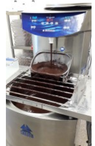
Hogarths chocolate factory