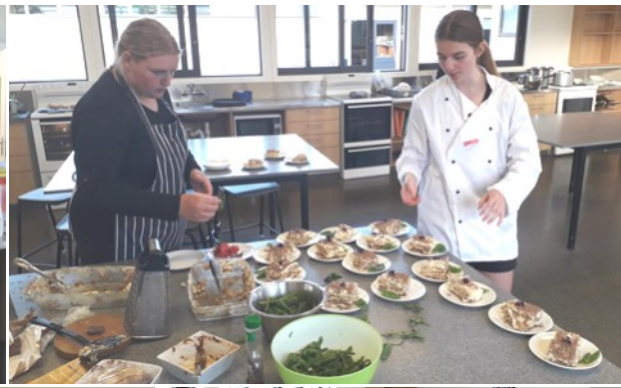
Year 11 Hospitality Dinner with their Whānau