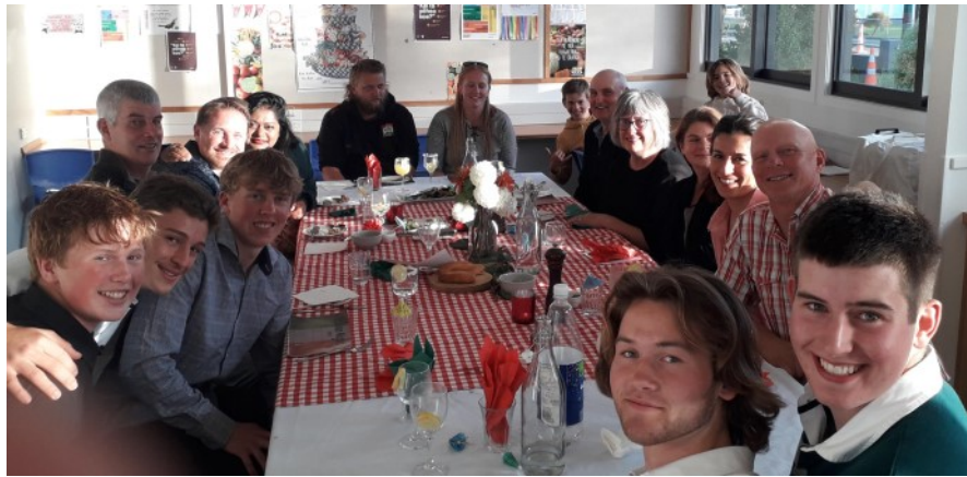
Year 13 Hospitality Culinary Tour of Nelson (photos below)